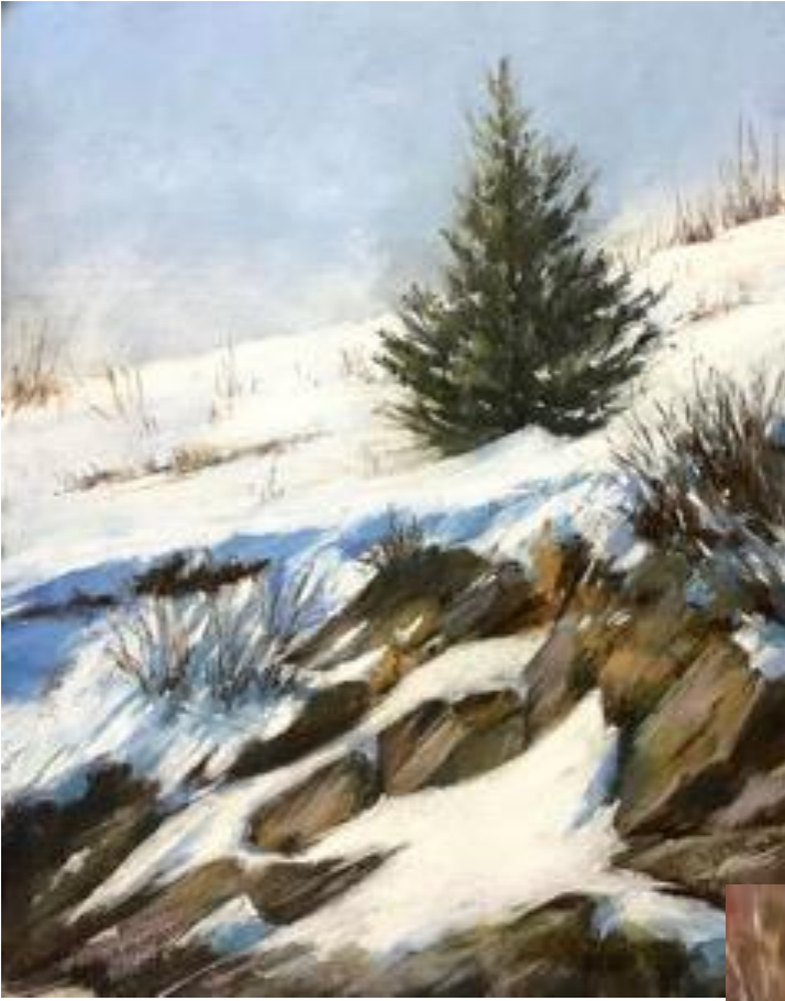
"Taking a Stand" 8 x 10 (above)

The two paintings "Taking a Stand" and "First Snow on Shaker Mill Pond" were selected for the Pastel Society of Maine's Spring Members Show. You can see the virtual show from May 1-31, 2021 at https://www.pastelsocietyofmaine.org/ . The Zoom opening is on May 8 at 6 p.m.