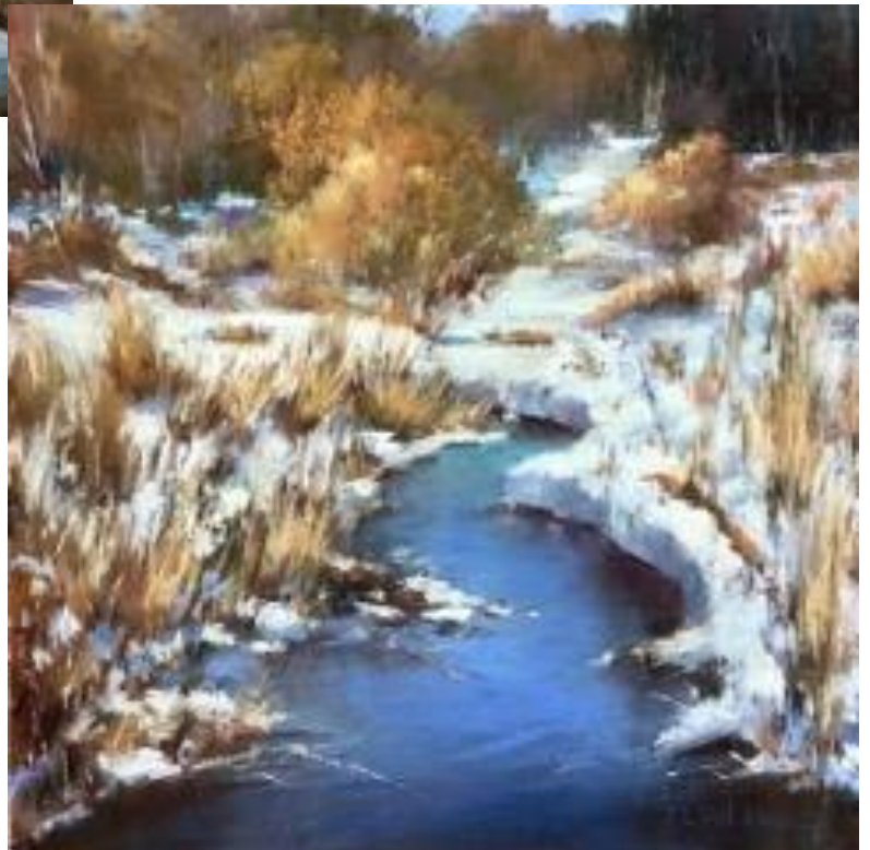
"First Snow on Shaker Mill Pond" 10 x 10 (above)